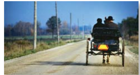
Amish Farm Community Montgomery, IN