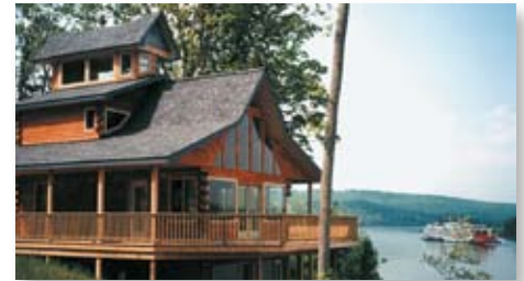
Colucci Cabins Magnet, IN