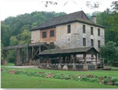
"Gristmill" Springmill State Park Mitchell, IN