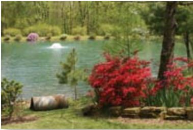
Azalea Path Arboretum Petersburg, IN