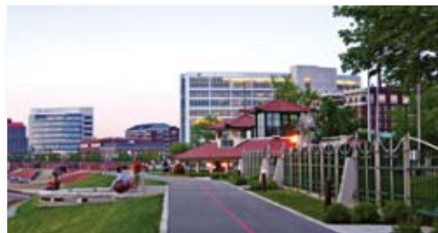
Pigeon Creek Greenway Evansville, IN