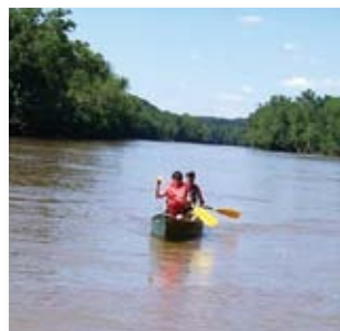
West Boggs Lake Martin County, IN