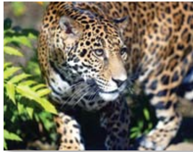
Amazonia Evansville, IN