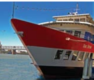
Star Cruise Lines Jeffersonville, IN