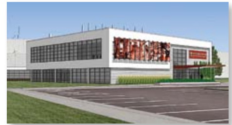
Toyota Visitors Center Princeton, IN