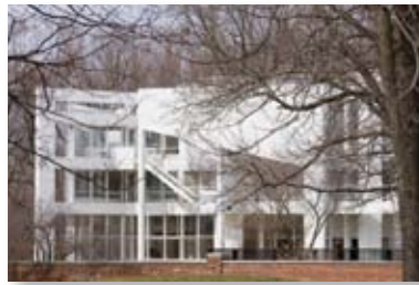
Atheneum/Visitors Center New Harmony, IN