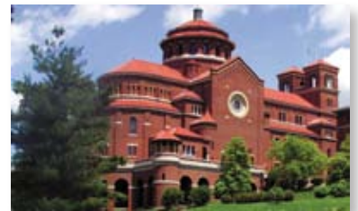
Monastery Immaculate Conception Ferdinand, IN