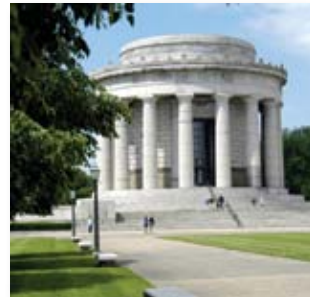
George Rogers Clark National Historic Park Vincennes, IN