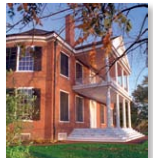
"Grouseland" Harrison Mansion Vincennes, IN