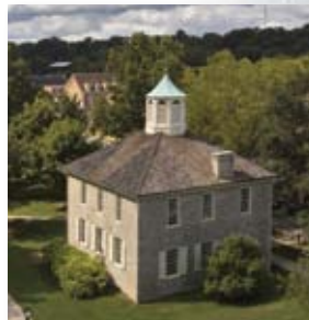
First State Capital Corydon, IN