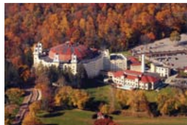
West Baden Springs Hotel French Lick, IN